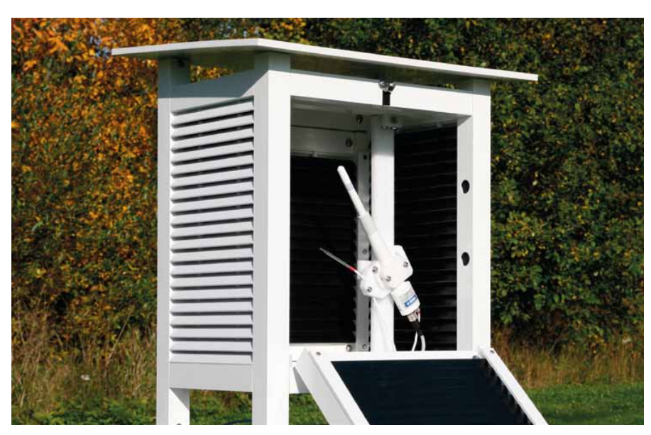
HMP155 with an additional temperature probe and optional Stevenson screen installation kit

The Vaisala HUMICAP® Humidity and Temperature Probe HMP155 provides reliable humidity and temperature measurement. It is designed especially for demanding outdoor applications.