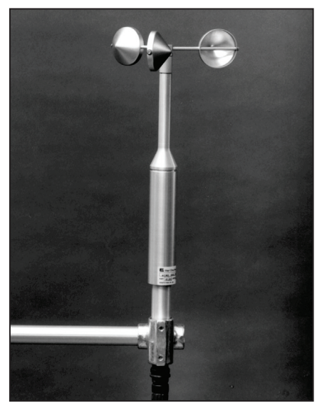
010C Wind Speed Sensor