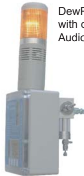
DewPatrol with optional Audio Visual Alarm