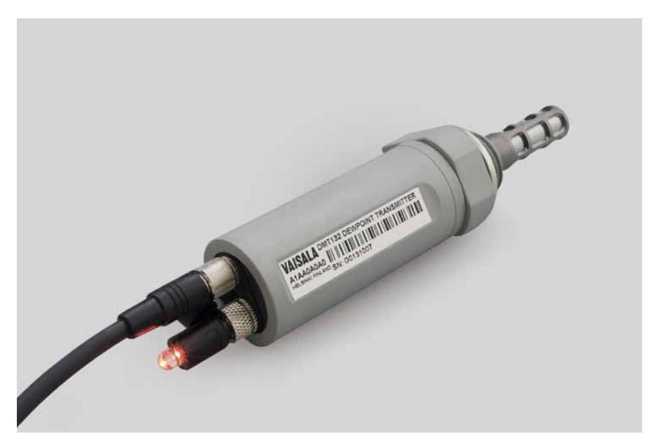
The optional LED warning light tells the user when the defined dew point limit has been exceeded.

The Vaisala HUMICAP® Dewpoint Transmitter DMT132 is an affordable dew point measurement instrument designed to verify the functionality of refrigerant dryers. It is especially well suited for OEM dryer manufacturers.