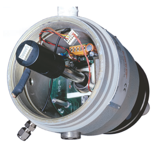
Inside the FGA 311 transmitter

The FGA 311 is a simple, low-cost, in situ, flue gas oxygen transmitter. The zirconium oxide oxygen sensor is installed directly into the flue stack or furnace wall. For low-temperature applications, a heater is included to maintain a constant temperature on the zirconium oxide sensor. The FGA 311 is available in both weatherproof and explosion proof configurations. Typical applications for the FGA 311 include natural gas-fired utility and municipal boilers, as well as natural gas-fired process heaters. The FGA 311 is ideal for boiler and furnace manufacturers due to its low-cost, basic transmitter configuration.